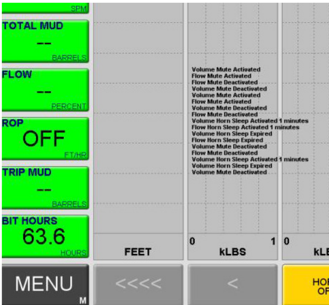
Figure 3: Samples of memos sent to the EDR